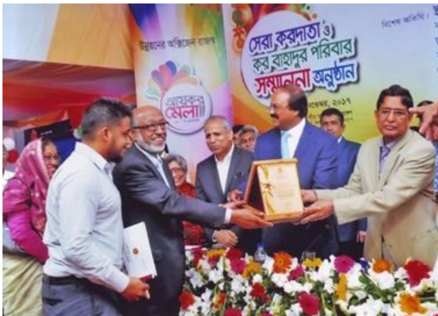
Pic: Receiving recognition from the Govt. of Bangladesh for “কর বাহাদুর পরিবার”